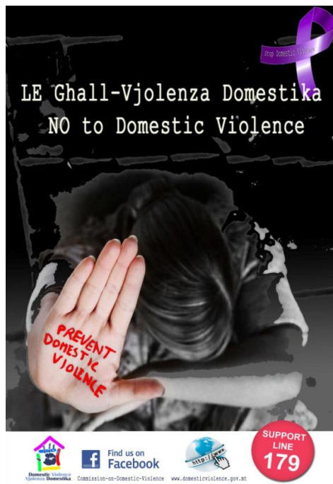
Prevention of domestic violence and violence on women

The second aspect of ‘No to Domestic Violence’ raised awareness on the importance of prevention and seeking help.