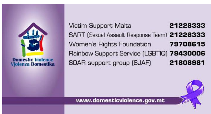
Information Card (back)