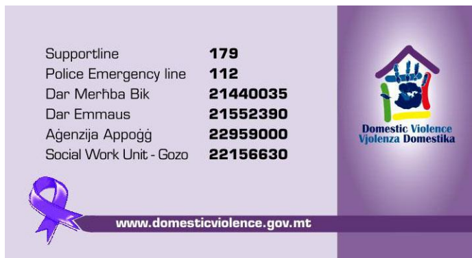
Information Card (front)

Through the dissemination of information on domestic violence on where to seek help, contact was made with the various stakeholders who are likely to come in contact with persons experiencing domestic violence. Through the various stakeholders the Commission on Domestic Violence is outreaching the general public, especially when they are most in need. The Commission is also assisting stakeholders in their work towards helping those who seek their help or guidance.