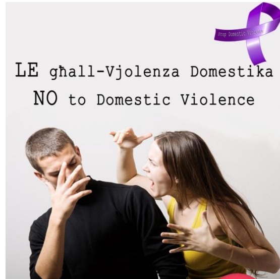
Verbal abuse and violence on men

The generic theme ‘No to Domestic Violence’ raised awareness on different aspects such as the effects of domestic violence that is witnessed by children. It also emphasised that verbal abuse is another form of domestic violence and this can be perpetrated by both males and females.