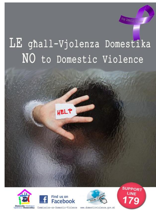
The importance of seeking help!